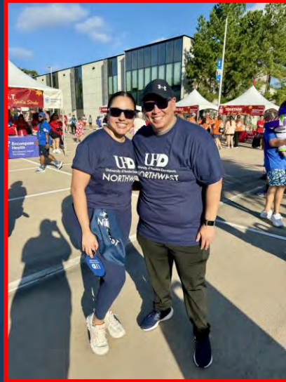
American Heart Association