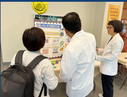
UHD nursing and faculty organized the Health Fair in April, 2022.

UHD College of Sciences & Technology RN to BSN