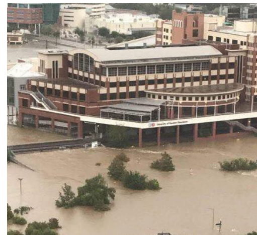
Photo Courtesy of the City of Houston Harvey: The Road to Recovery Pg. 4-5