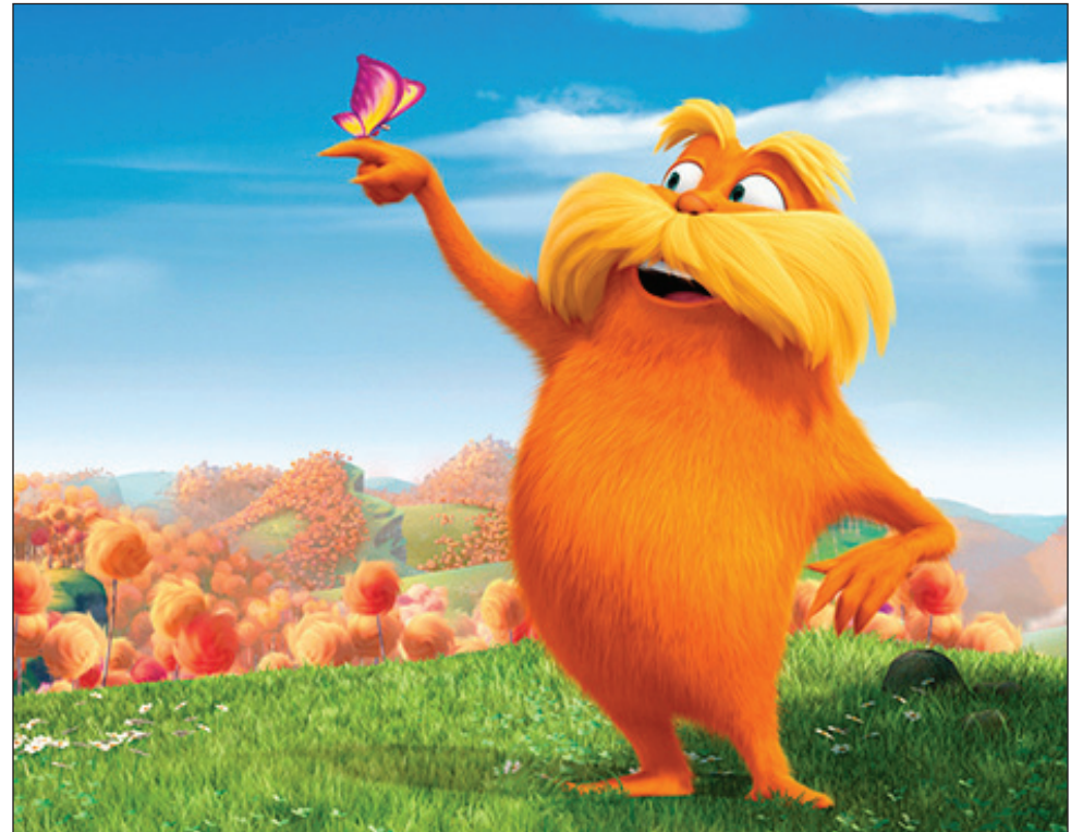
The Lorax may speak for the trees, but the movie teaches lessons on greed.

Dr. Seuss' Lorax is a good family escape with an important message that will entertain the audience.