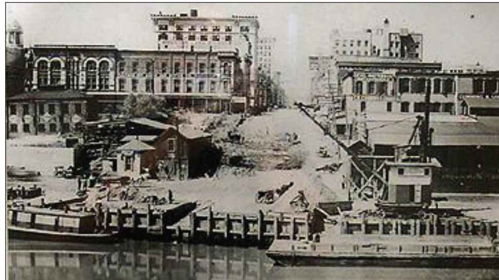
Main Street, circa 1890

The University of Houston Downtown was destined to come into being and to thrive according to what people choose to make it. Nothing else stood a ghost of a chance.