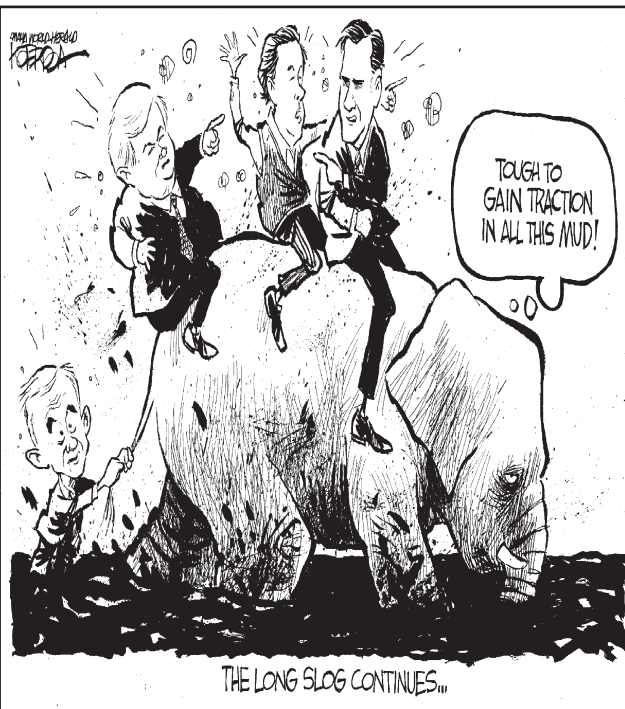
THE LONG SLOG CONTINUES...