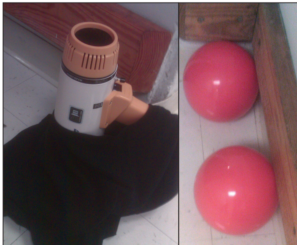
Confiscated bull horn (with the shirt used to conceal it) and dodge balls from the Occupy protest at the downtown Hilton March 8.

The protest, while entertaining for the crowd, was probably less successful than the occupiers would like to think. When asked what he thought of the cause, a bystander said he thought they [the protestors] were stupid. "Don't get arrested for something you can't control."