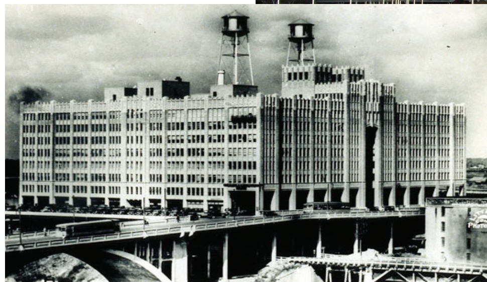
ABOVE: UHD present day. LEFT: Building and Main Street Viaduct, Merchants & Manufacturers Building, 1930s