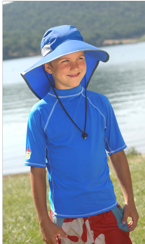
With recent news about the inadequacy of many sunscreens, a handful of clothing manufacturers now sell shirts, pants, dresses and hats bearing SPF (sun protection factor) ratings.